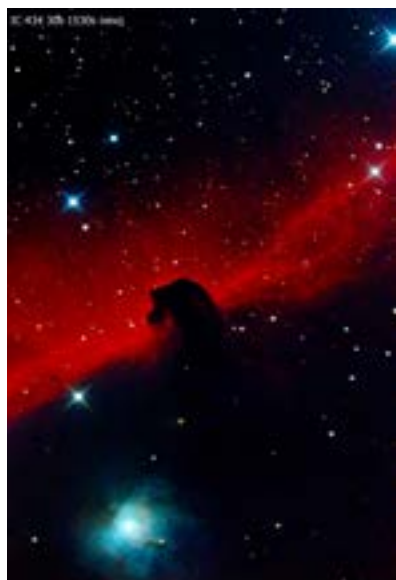
Horsehead Nebula (IC-434)